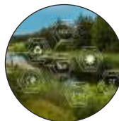
Internet of Things (IoT), Artificial Intelligence in Agriculture