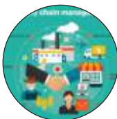
Supply Chain Management