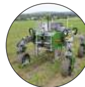
Farm Mechanisation and Agri Engineering