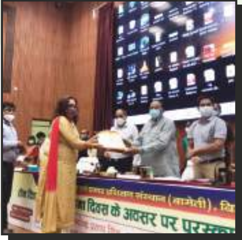
Best Start up “Plutus Plus” in Waste to Wealth by Hon'ble Agriculture Minister Bihar Sh. Amrendra Pratap Singh Ji