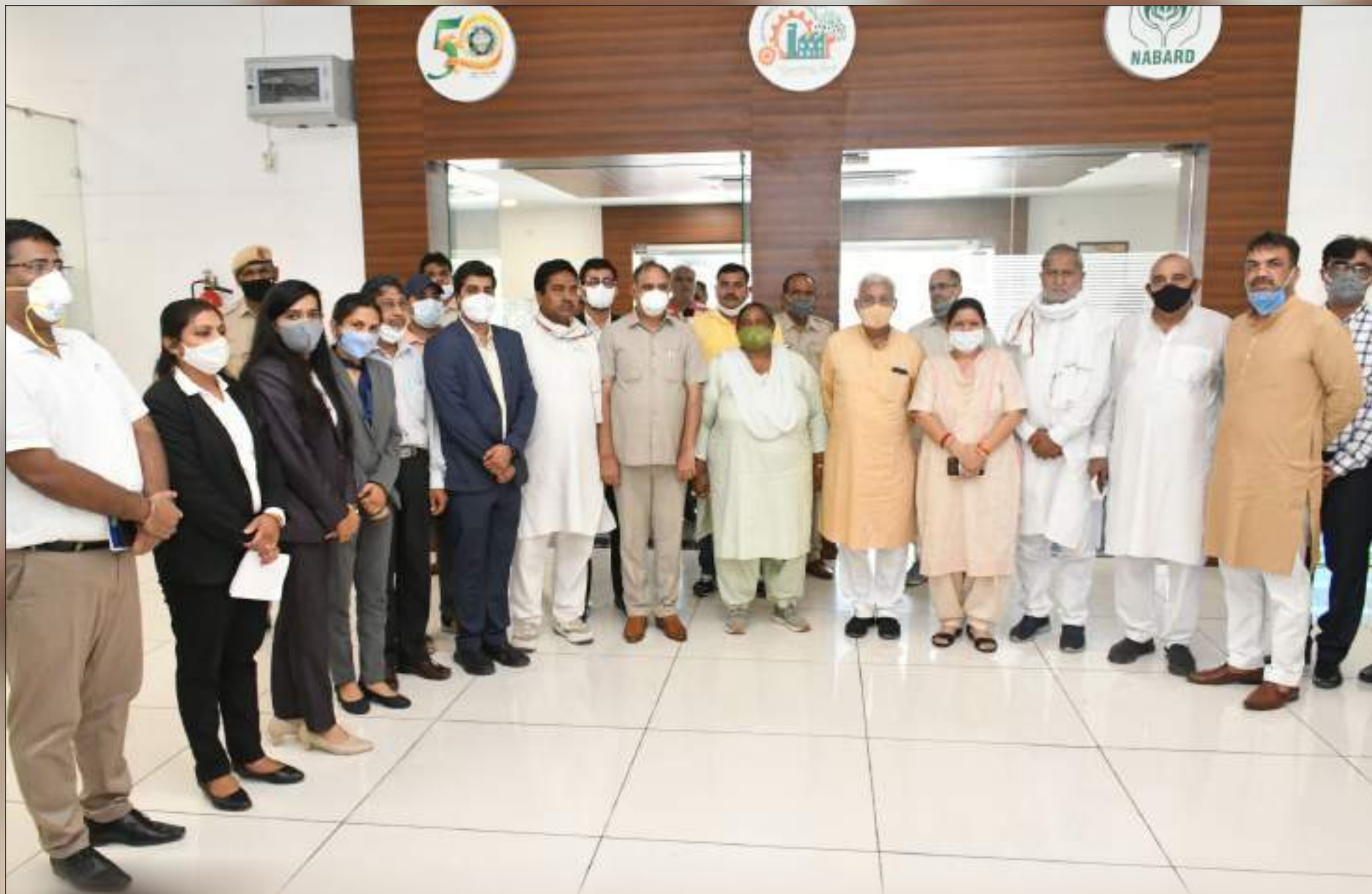
Hon'ble Member of State Petition Committee of Haryana Vidhan Sabha visiting ABIC on 30 th July 2021.