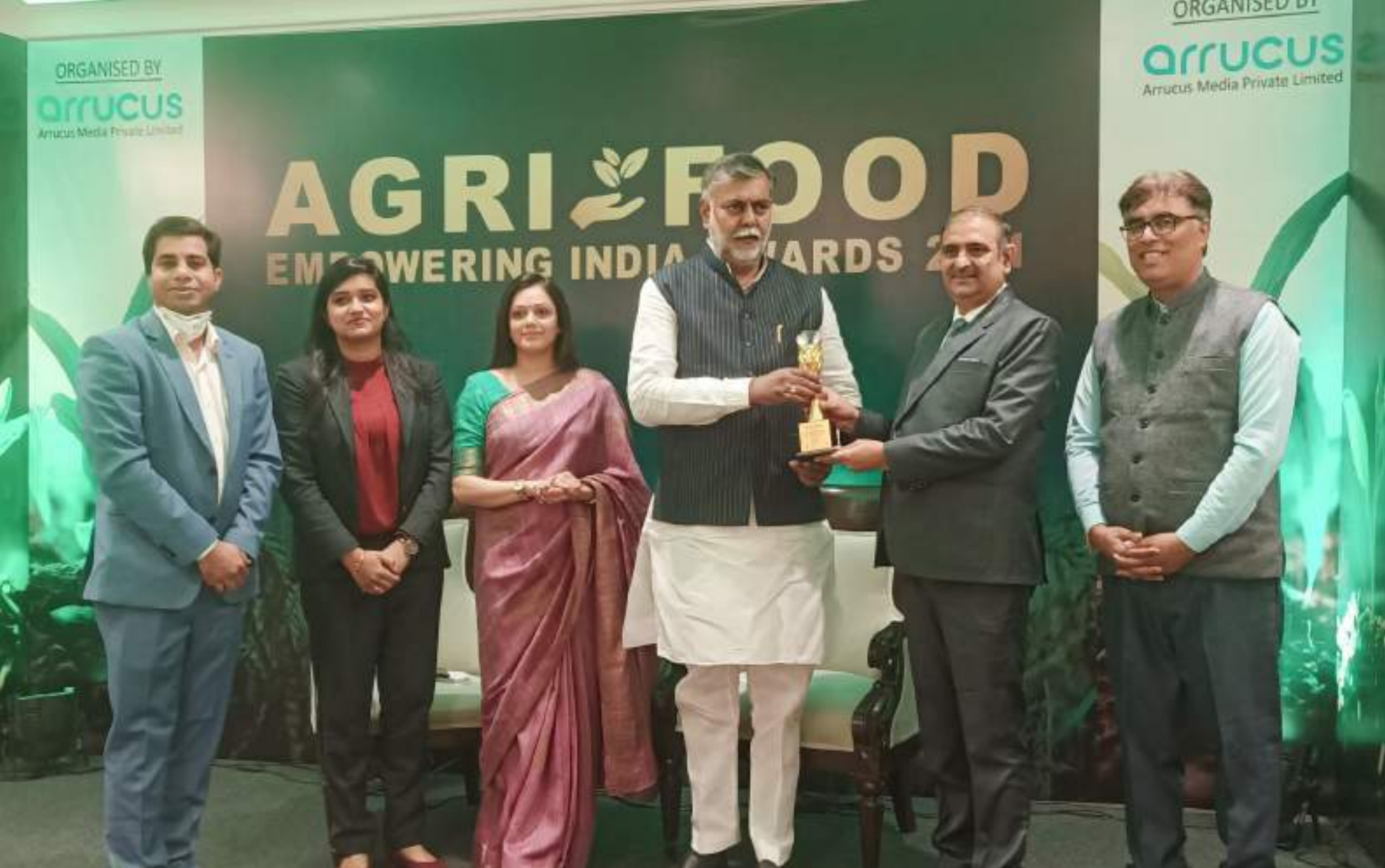
Sh. Prahalad Singh Patel, Minister – MoFPI, GoI Awarded ABIC, Hisar as No. 1 Agri Business Incubation Centre for Excellence in Multiple Incubation Centres Agri Food Awards: 12 th Nov 2021