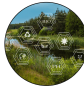
Internet of Things (IoT), Artificial Intelligence in Agriculture