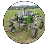
Farm Mechanisation and Agri Engineering