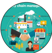
Supply Chain Management