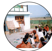
Agri Extension Education