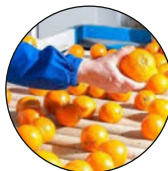
Harvesting and Post-Harvest Processing