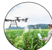
Agri-Input tools and technologies