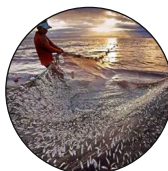
Dairying, Fishery & Aquaculture