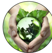
Natural Resource Management