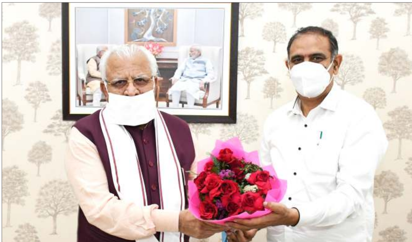
Vice-Chancellor honouring Hon'ble Chief Minister by presenting a bouquet.