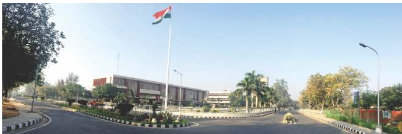
Administrative Block CCSHAU, Hisar