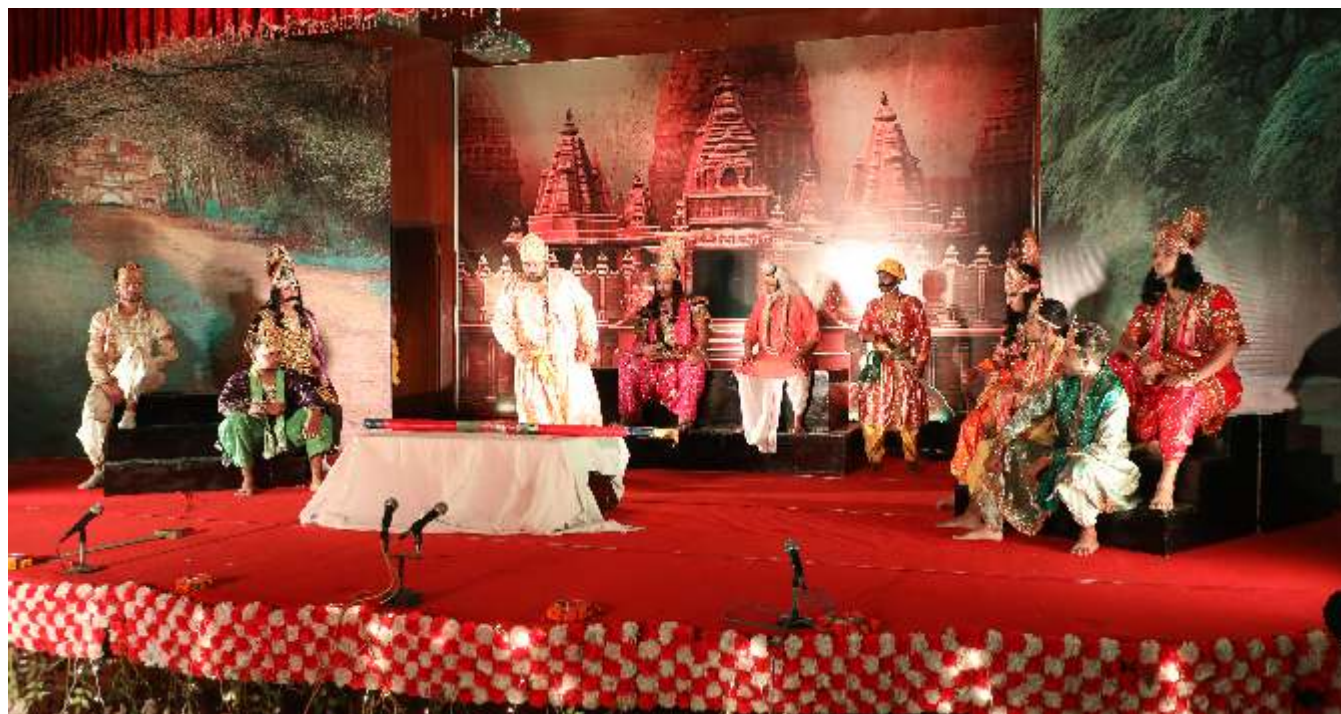
Glimpses of cultural events performed by students at CCSHAU, Hisar