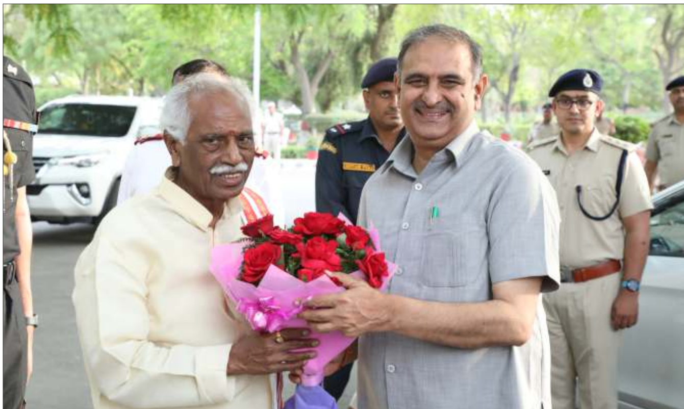
Vice-Chancellor honouring Sh. Bandaru Dattatreya, Hon'ble Governor of Haryana by presenting a bouquet.