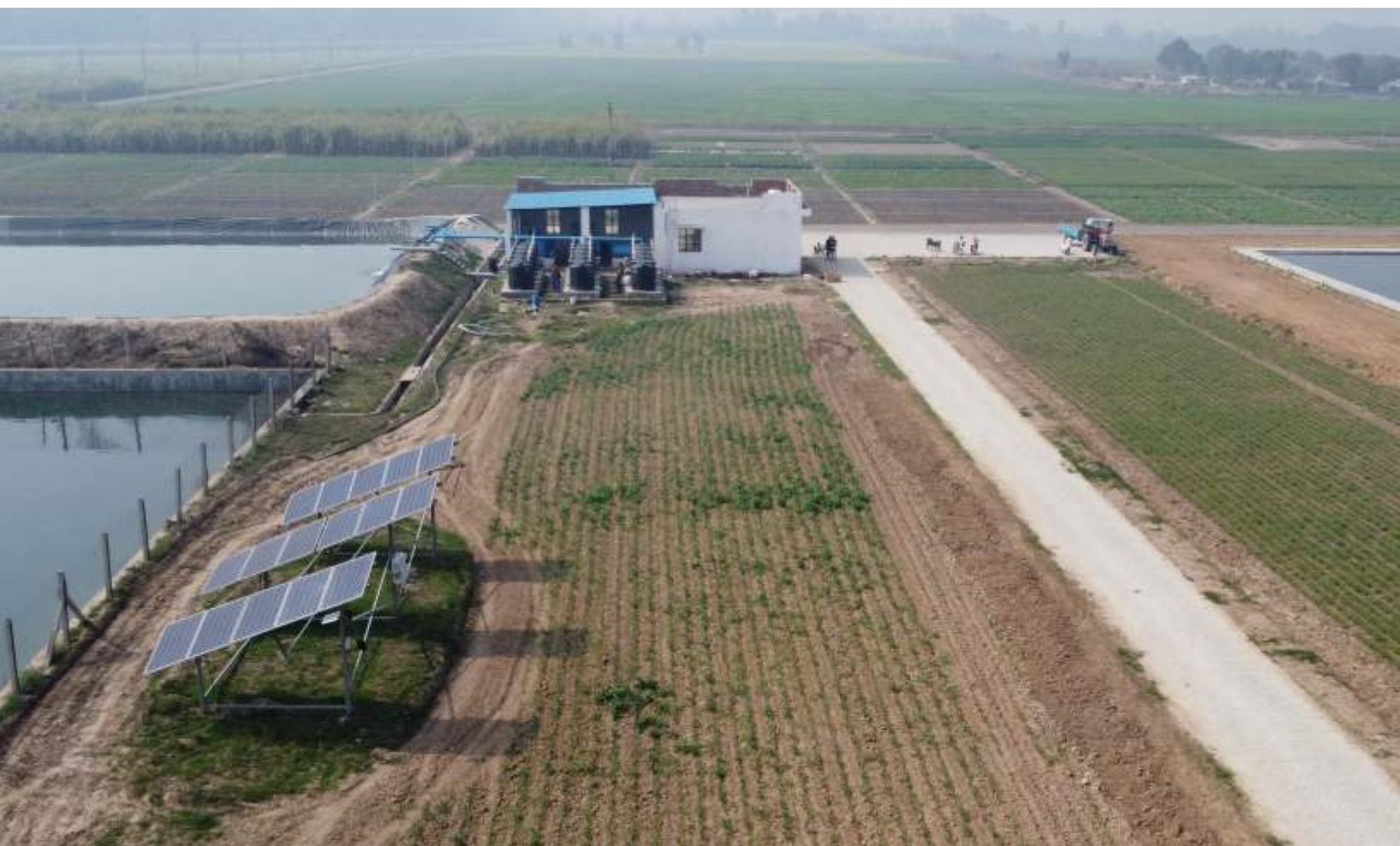
Aerial view of Farm Area of Deendayal Upadhyaya Centre of Excellence for Organic Farming

The main campus of the University is situated at Hisar at a distance of about 190 km North-West of Delhi on National Highway No. 9 and is 2.5 km from the Hisar Railway Station and 3 km from the Bus Stand. The University is spread over an area of 6084 acres at Hisar and 1424 acres at outstations. Area under farms at Hisar is 6428 acres and under buildings and roads is 736 acres. Since its existence, the University has been making rapid progress in building construction and has an excellent infrastructure. The University has one of the best developed campuses in India and fulfils academic and extra-curricular needs of the students.