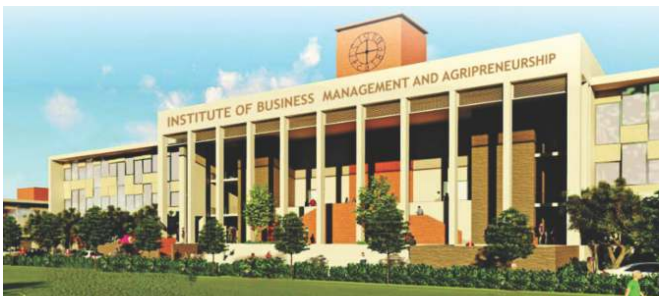
Architectural Model of Institute of Business Management and Agripreneurship, Gurugram

Classes of IBMA, Gurugram will be held at CCSHAU, Hisar till the facilities are created at IBMA, Gurugram