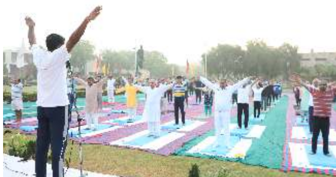
HAU fraternity attending Yoga Camp for good health