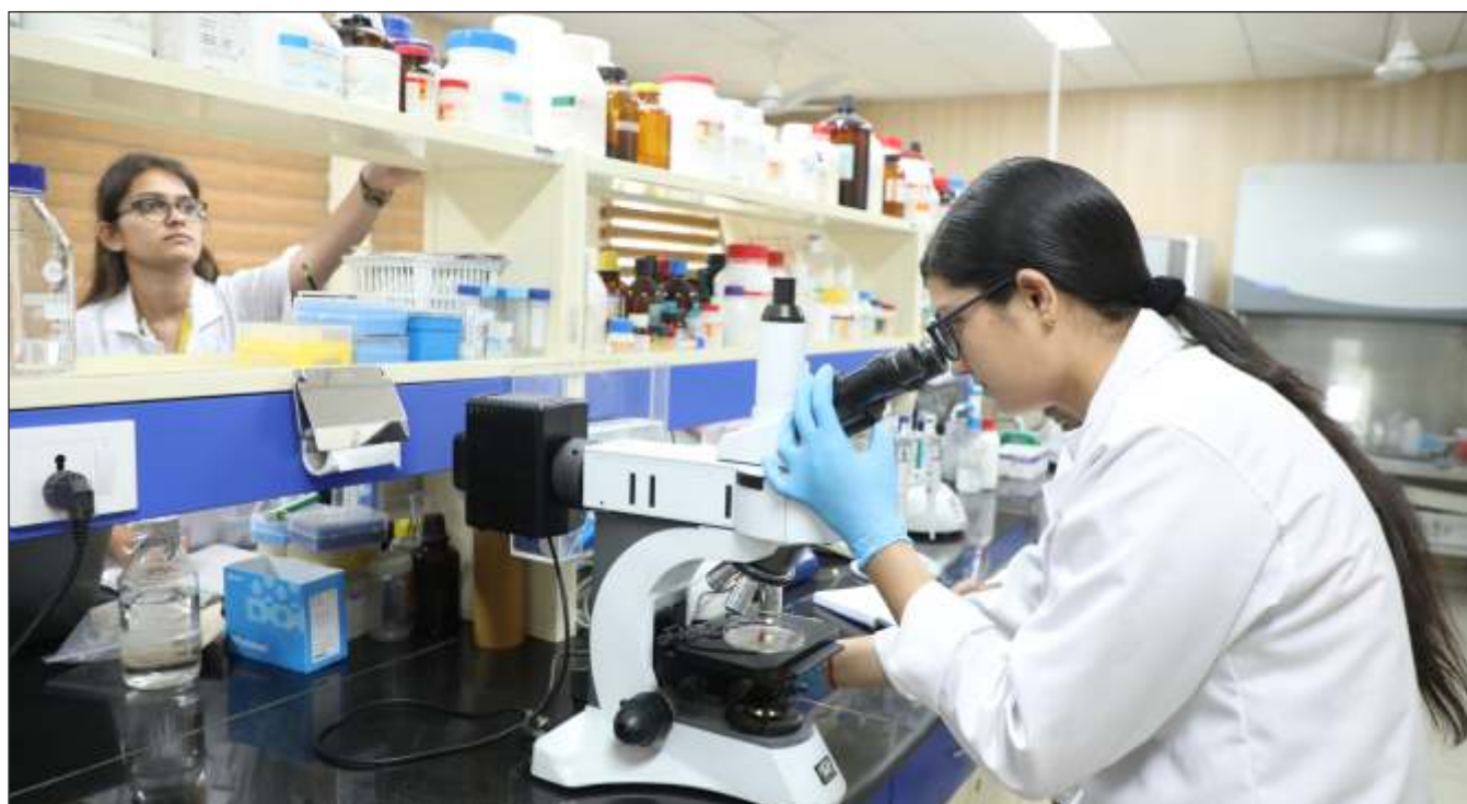
Excellent lab facilities at CCSHAU

Rest of the points would belong to the general category.