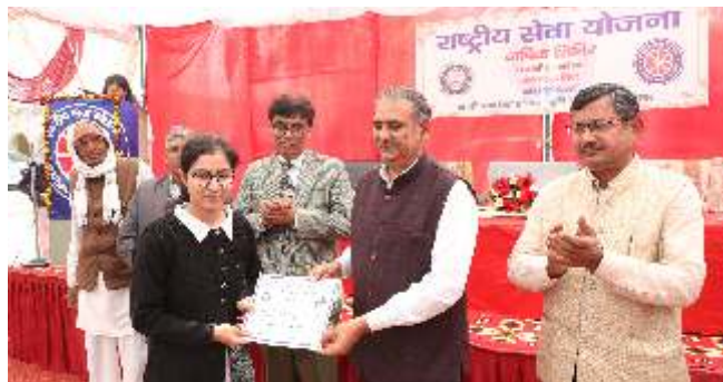
Certificate distribution by Vice-Chancellor to the participants at NSS Camp