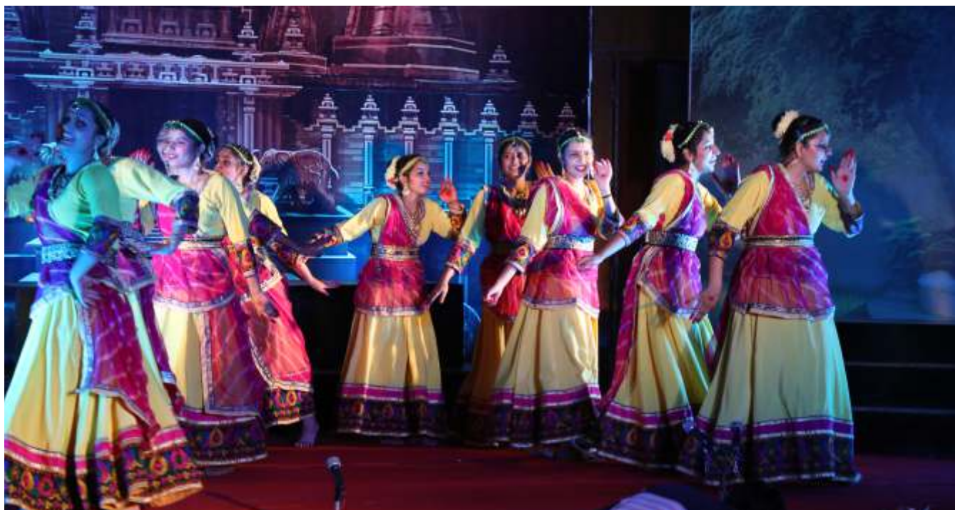
Glimpses of cultural events performed by students at CCSHAU, Hisar