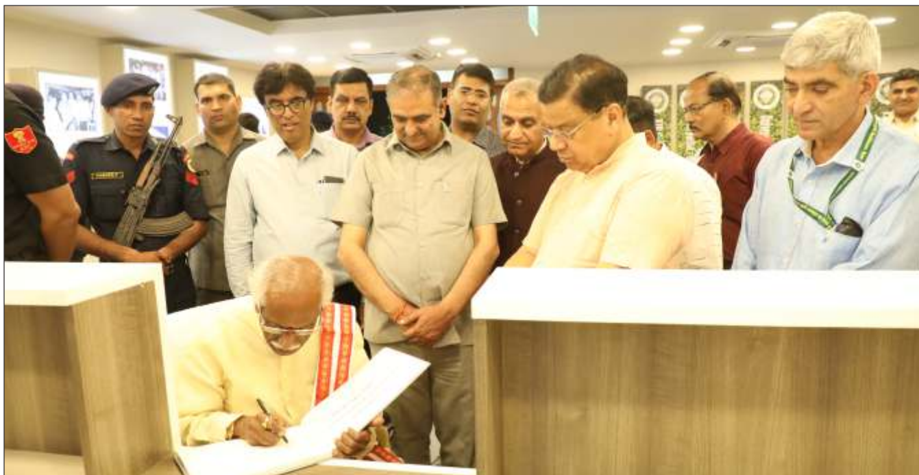
His Excellency Governor of Haryana Sh. Bandaru Dattatreya writing his valuable comments in 'Visitor Book' during his visit to Agricultural Sciences Museum

science education up to higher level, Department of Science & Technology has started a scholarship scheme for the Under Graduate B.Sc. (General) and Post Graduate students opting for basic science subjects viz. Physics, Chemistry, Botany, Zoology, Mathematics and Geology. Every year 100 students each of B.Sc.-1 st year and M.Sc. (Previous) are selected on merit basis. Scholarship of Rs. 4,000/- per month + contingency stipend of Rs. 4,000/- once in a year to B.Sc. students & scholarship of Rs. 6,000/- per month + contingency stipend of Rs. 5,000/- once in a year is provided to M.Sc. students. The details of the scheme are available on office website dstharyana.org .