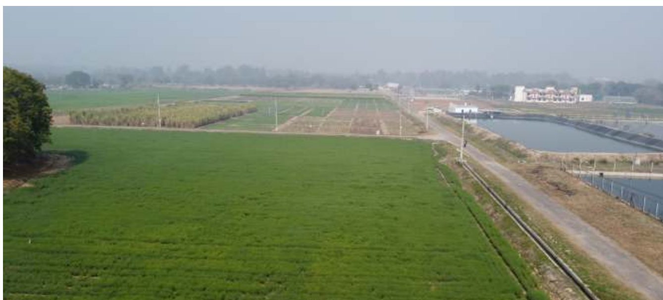
Crop raised under assured organic conditions at Deendayal Upadhyaya Centre of Excellence for Organic Farming