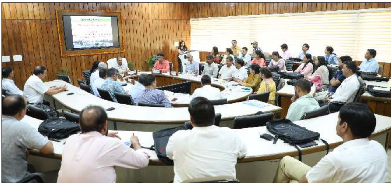
Vice-Chancellor at concluding of refresher course on “Extension Education Management” at Directorate of HRM, CCSHAU, Hisar