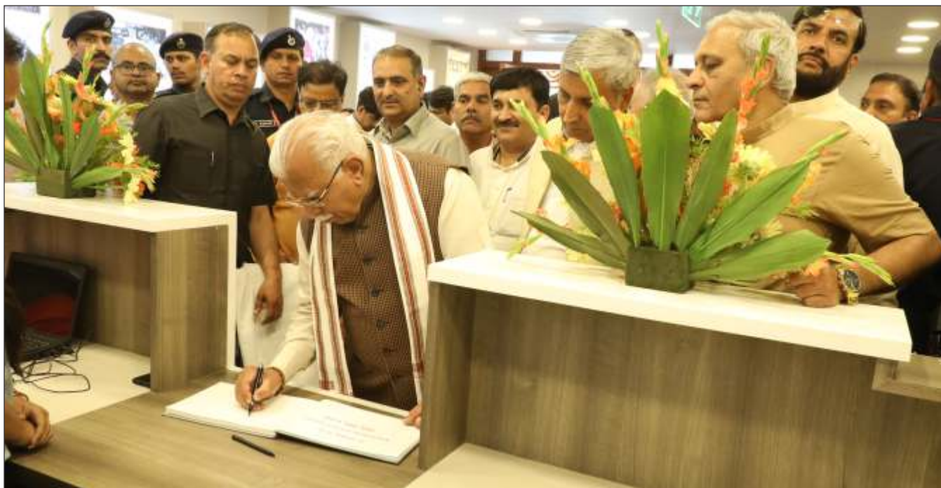
Chief Minister Sh. Manohar Lal writing his valuable comments in 'Visitor Book' during his visit to Agricultural Sciences Museum

an OGPA of 7.5/10.0 basis or above or acquires later and maintain the same shall be awarded merit stipend of the value of Rs. 10000/- per month provided they are not in receipt of any duty pay/monetary aid from any source except sports awards.