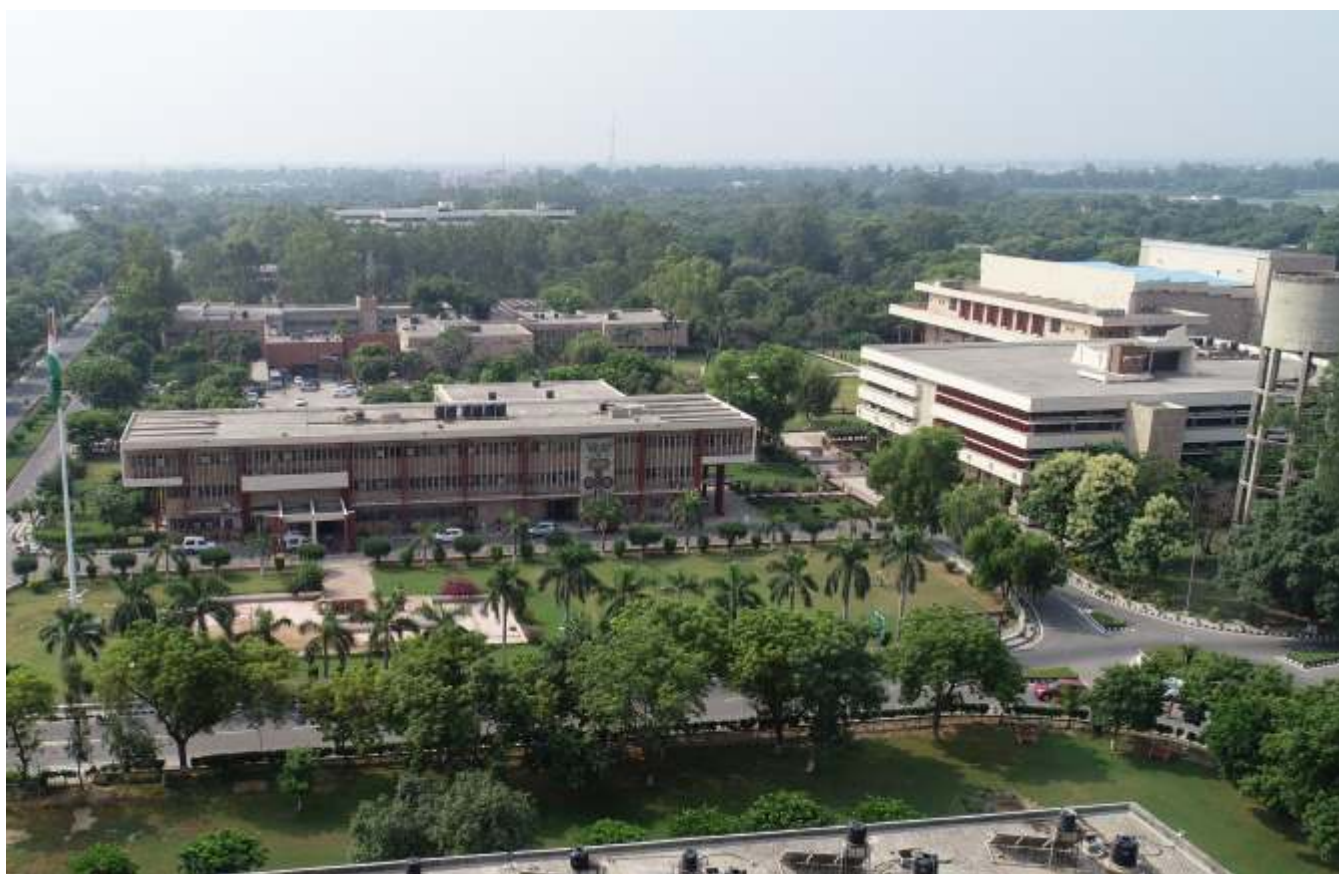
Aerial view of Lush Green Campus of CCS HAU