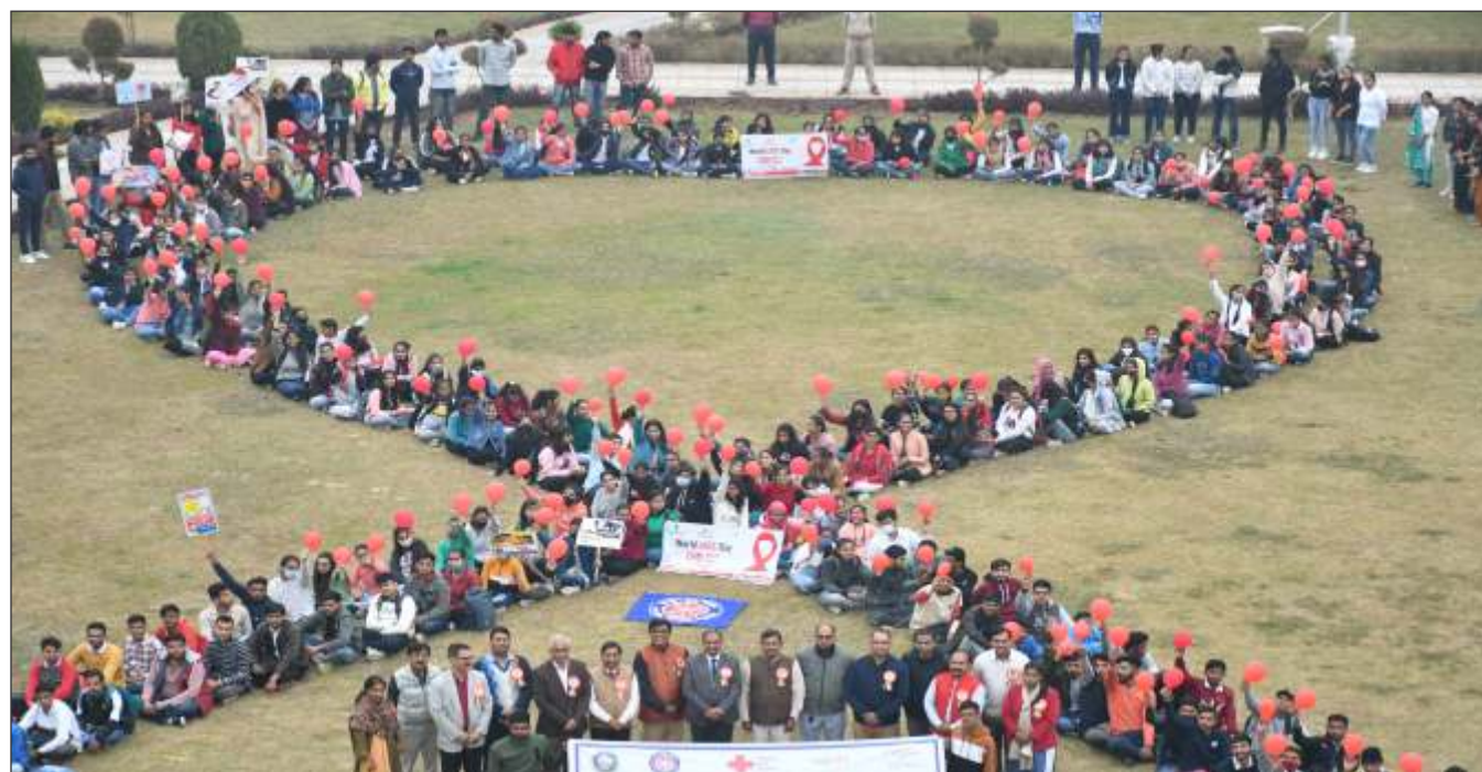
Students of the University organizing World Aids Day

Director of Extension Education/Director of Research CCS Haryana Agricultural University, Hisar