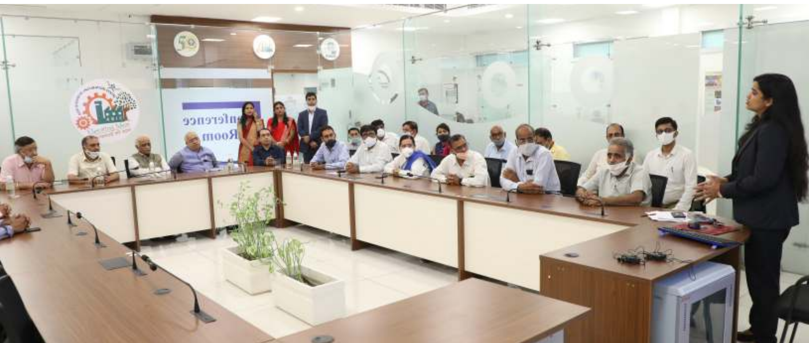
ABIC – CEO presenting the achievements and future plans to worthy Vice-Chancellor and dignitaries