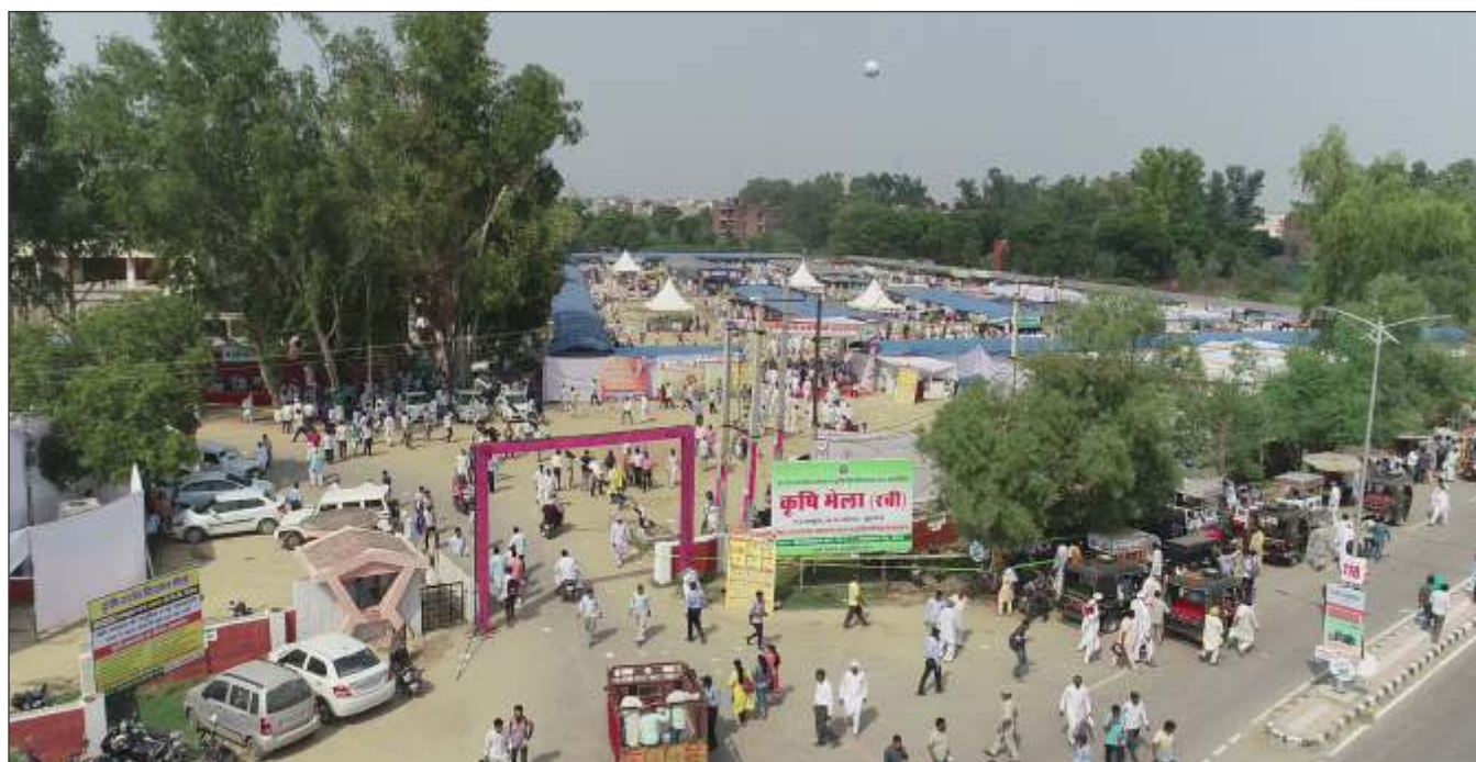
Aerial view of magnificent Krishi Mela at CCSHAU, Hisar

Any provisions or guidelines provided in the Prospectus are not final and are subject to modifications made by the Competent Authority under the Act & Statutes and if superseded by such decision by the Competent Authority, the latter will prevail and the information given in the Prospectus shall stand modified to that extent automatically.