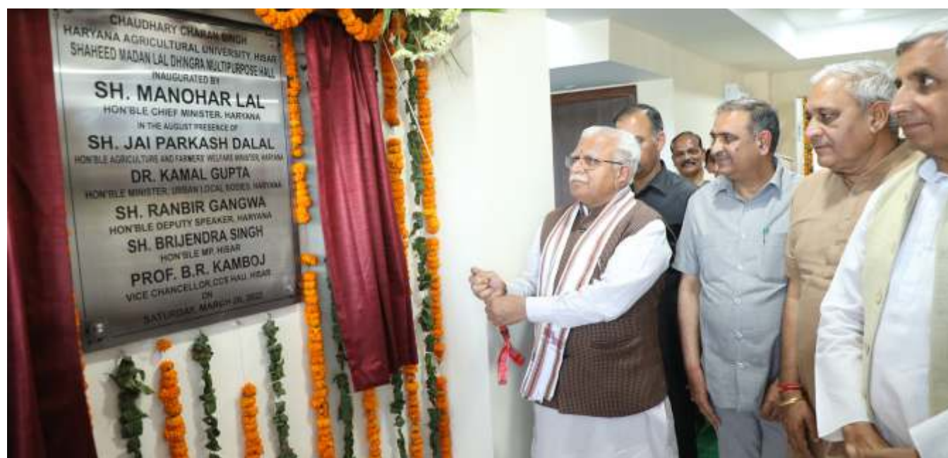
Chief Minister Sh. Manohar Lal inaugurating Shaheed Madan Lal Dhingra Multipurpose Hall at Giri Centre