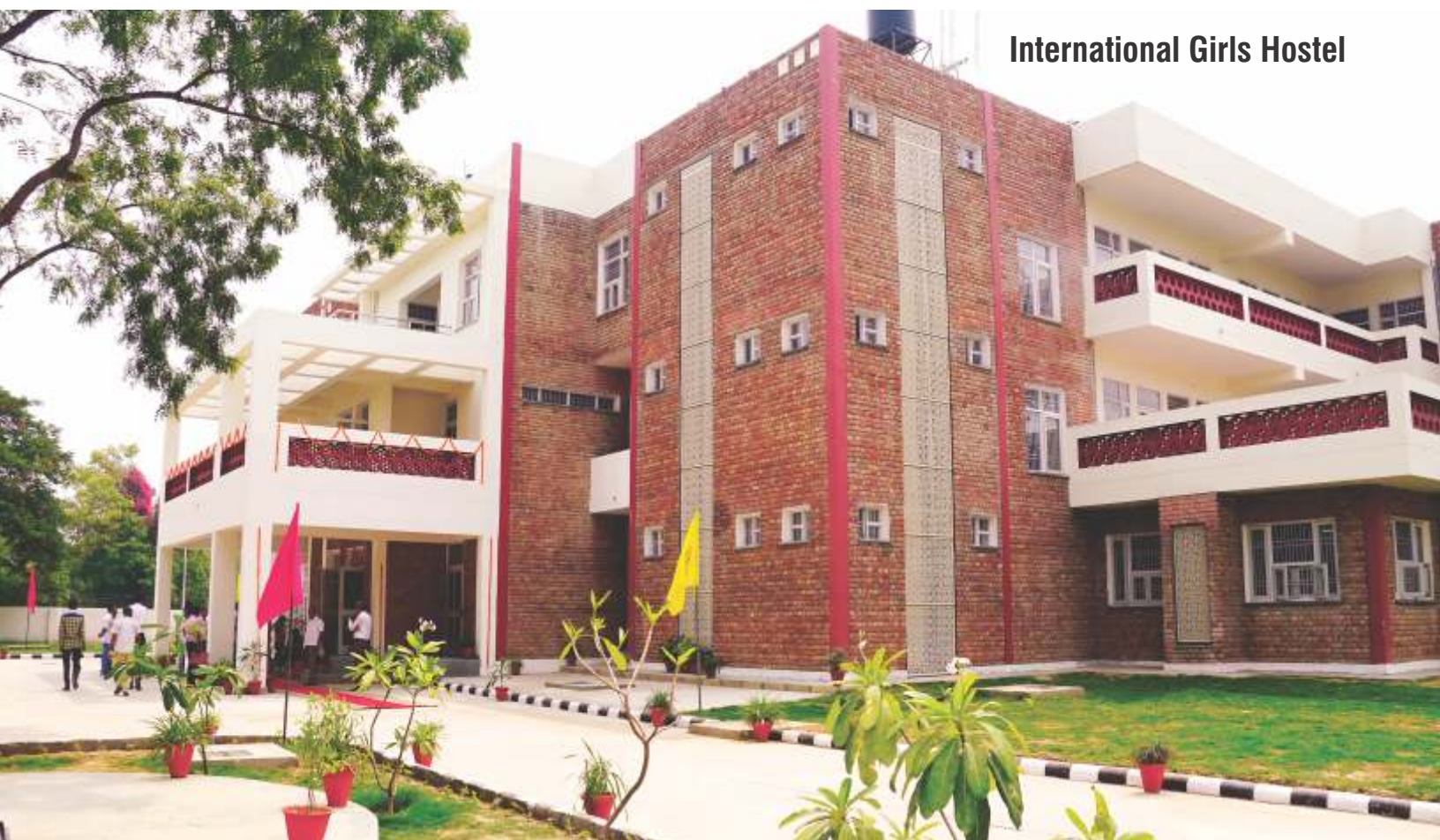
International Girls Hostel

international standard has also been provided in the Athletic Stadium. Volleyball grounds have lighting arrangements for playing at night. Hockey, Football, Cricket and Basketball grounds are well maintained. Volleyball and Basketball grounds at Kaul Campus also have lighting arrangements for playing at night.