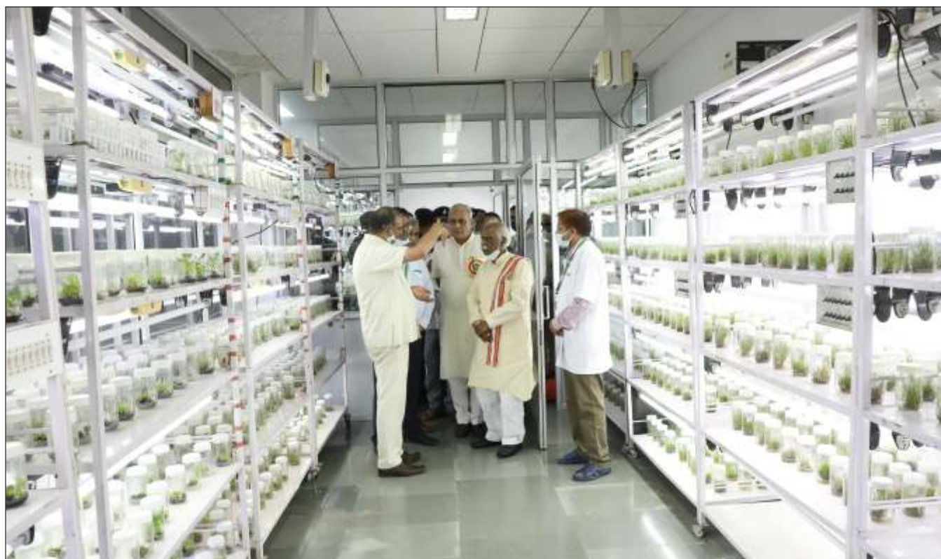
Hon'ble Governor of Haryana visiting the Tissue Cultural Lab in College of Bio-technology, CCSHAU, Hisar