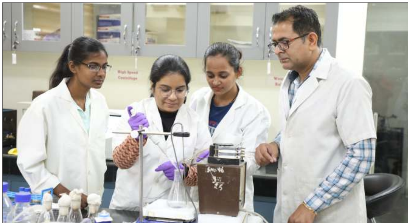
Students conducting research at a University Lab