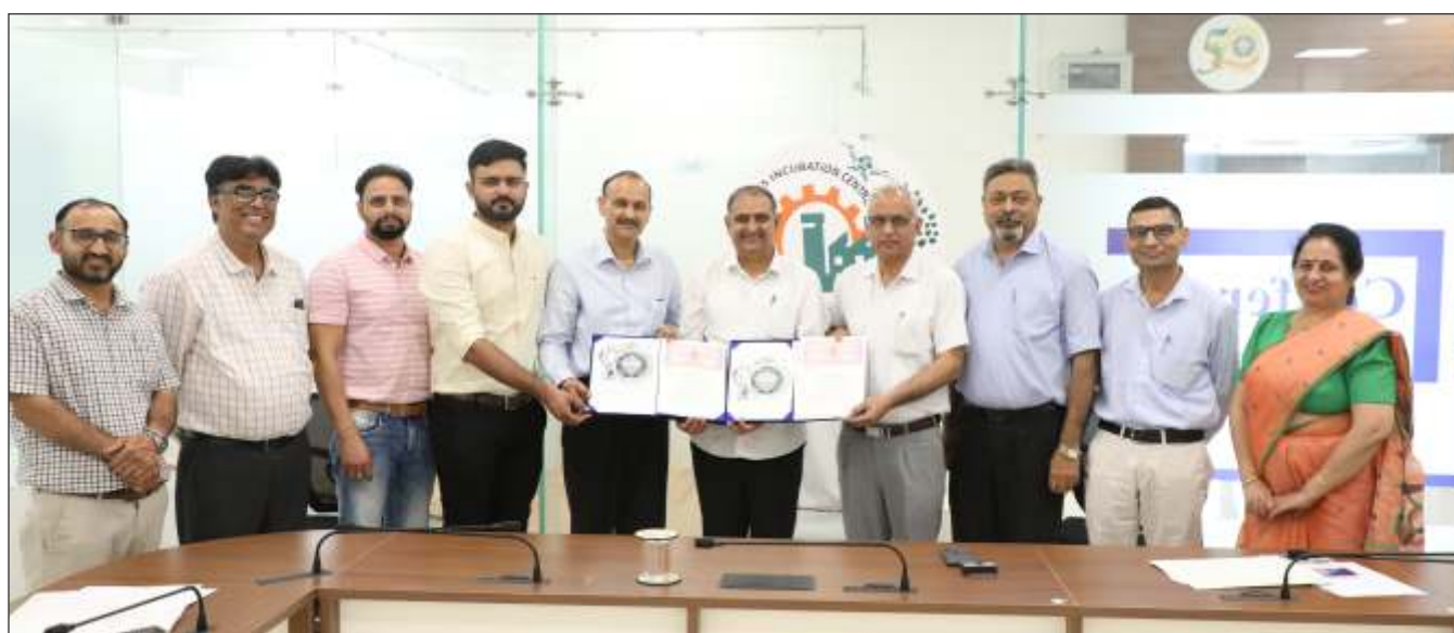
MoU being signed between CCSHAU, Hisar and Dev Agritech Pvt. Ltd., Gurugram