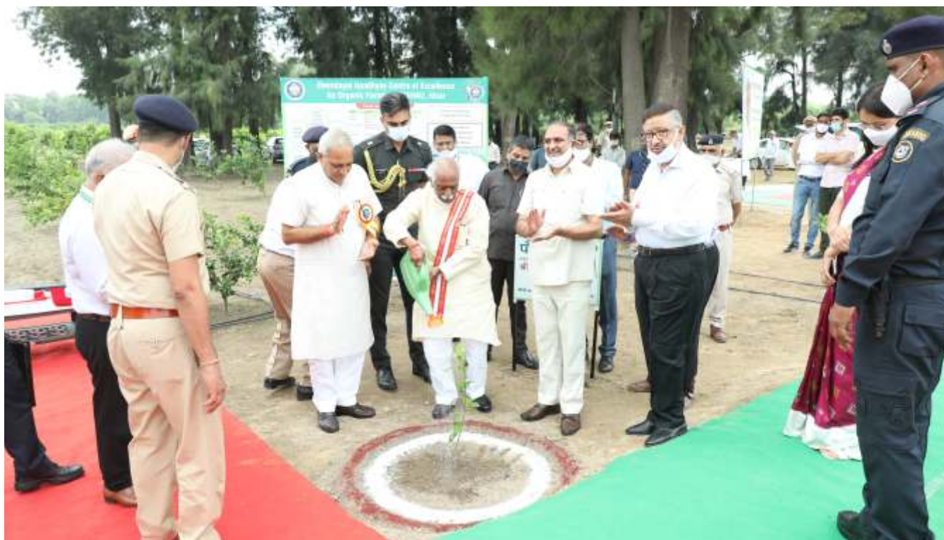
Plantation in Deendayal Upadhyaya Centre of Excellence for Organic Farming by Hon'ble Governor of Haryana, Sh. Bandaru Dattatreya