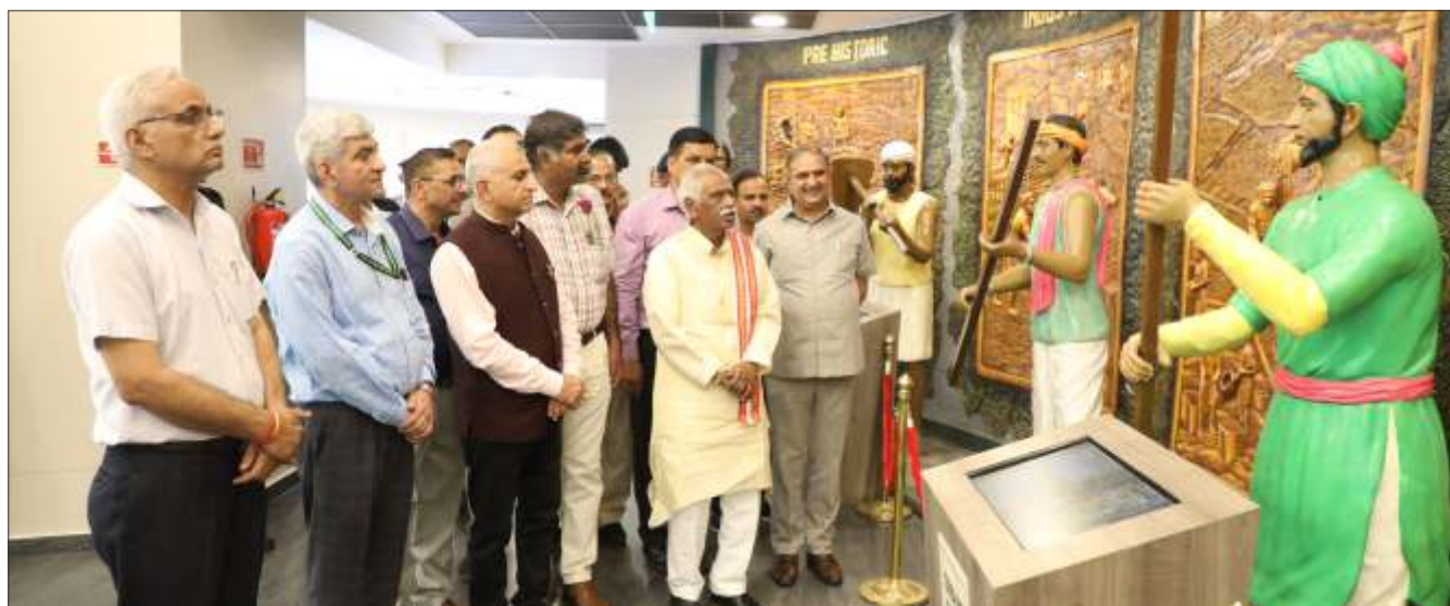
His Excellency Sh. Bandaru Dattatreya visiting Dr. Mangal Sein Agricultural Sciences Museum at CCSHAU, Hisar