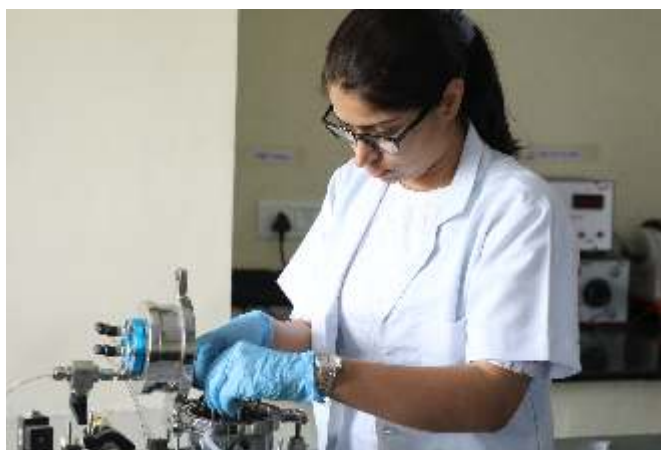
Students working at the laboratory for the research work