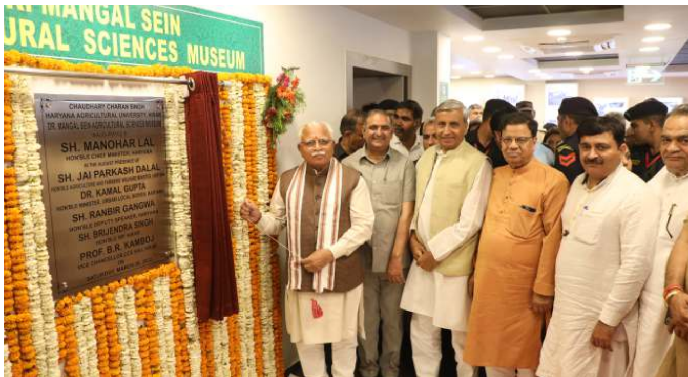
Chief Minister Sh. Manohar Lal inaugurating Dr. Mangal Sein Agricultural Sciences Museum at CCSHAU, Hisar

This post graduate course shall not only provide job avenues for students but also open a field of viable and effective interaction with national establishment related to various aspects of remote sensing. The main objective of this course is to develop multidimensional teaching in the field of remote sensing and GIS application in agriculture and environmental management.