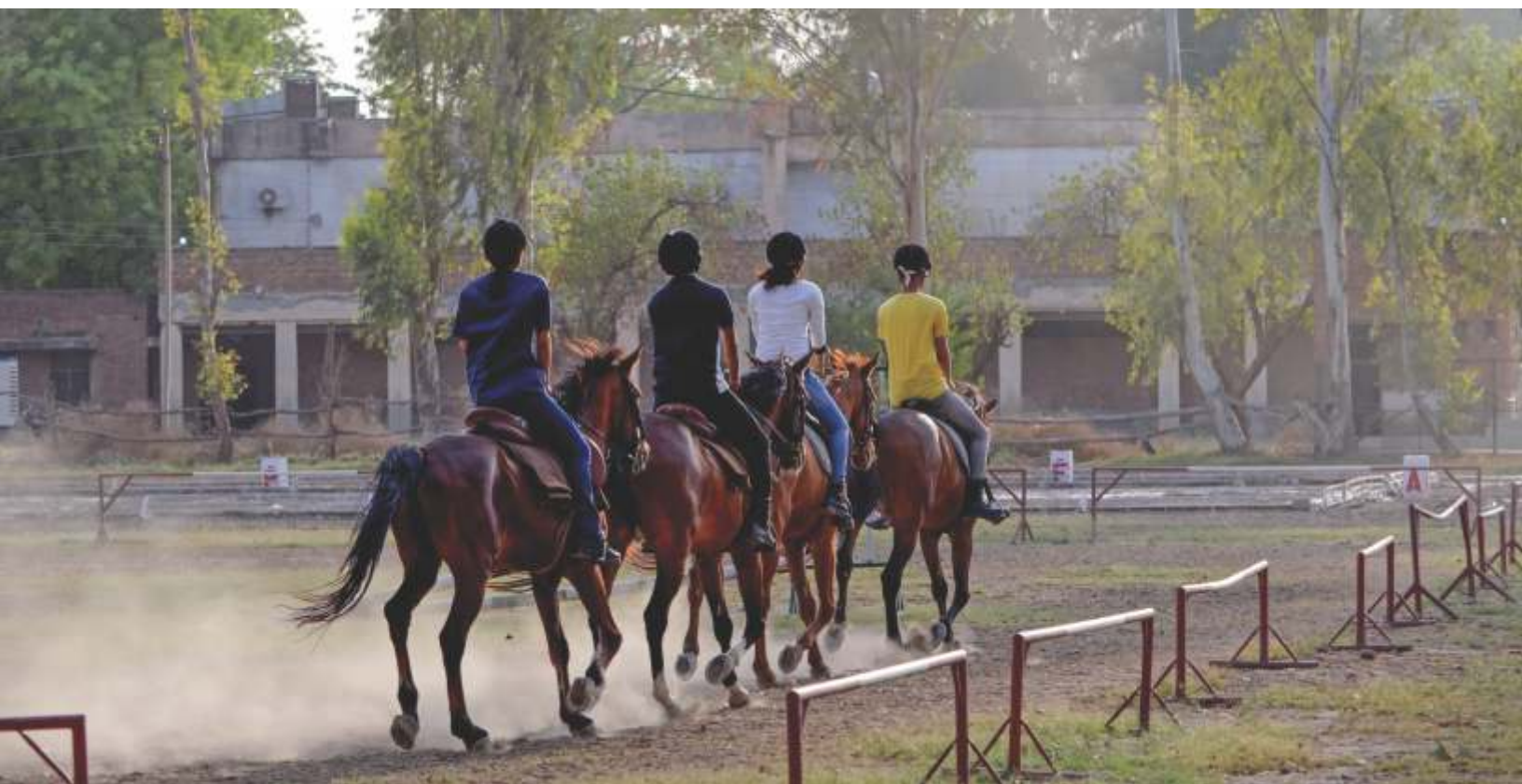
Equestrians (Students) being trained for horse riding