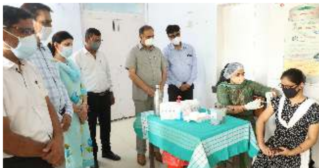
COVID-19 Vaccination Camp at CCSHAU, Hisar Campus for all the staff of the university below 45 years of age