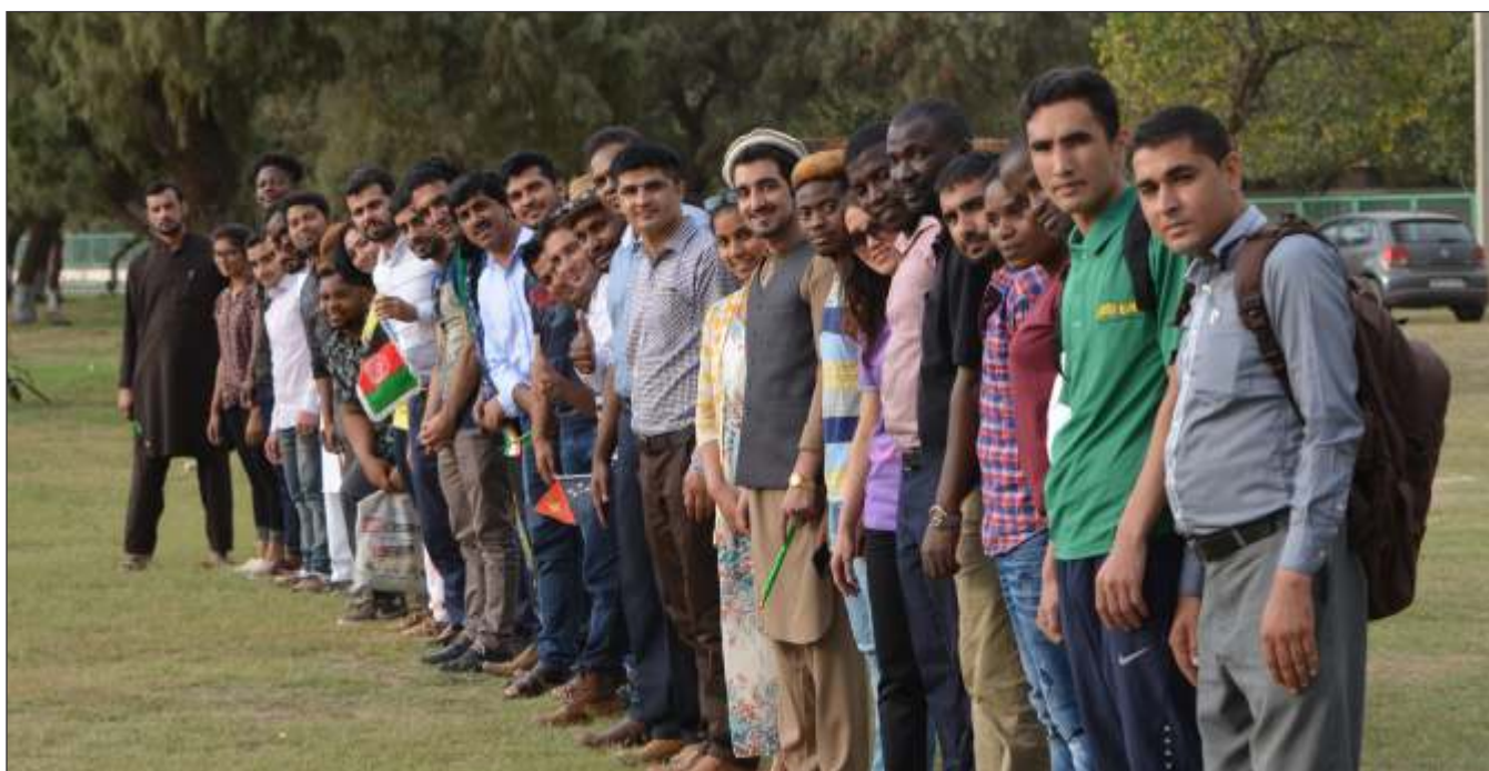
International Students pursuing their studies at CCS HAU, Hisar

Jurisdiction for all disputes shall be at Hisar.