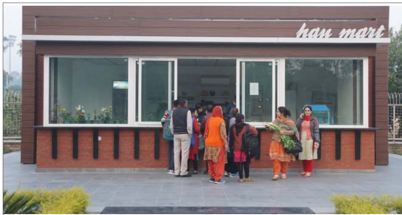
HAU Mart, a place for selling products prepared by students