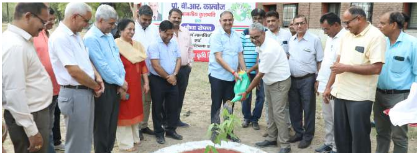
Plantation on World Environment Day in College of Basic Science & Humanities