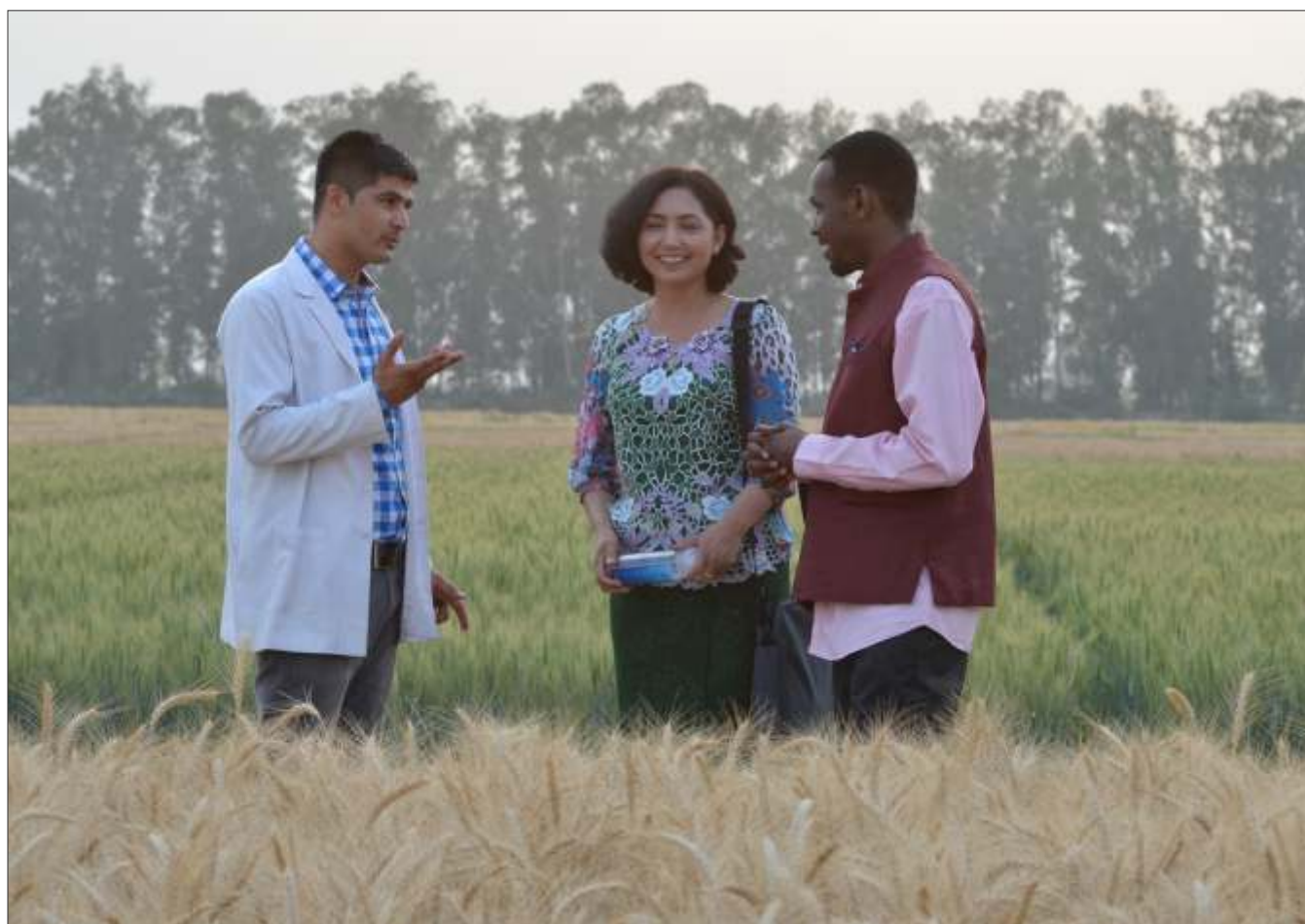
International students visiting the Research Farm area at CCSHAU, Hisar during practical classes