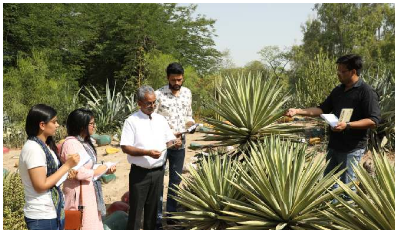
Dean College of Basic Sciences & Humanities interacting with students during classes at Agritourism Centre, CCS HAU, Hisar