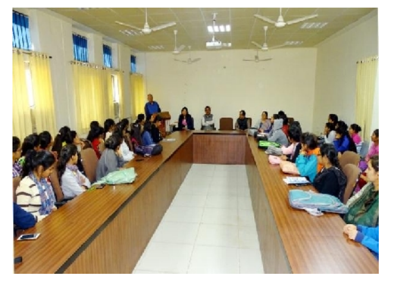
Training on "Enhancement of Handicrafts Skills for entrepreneurships Development" from Feb. 25 to Mar. 3, 2019