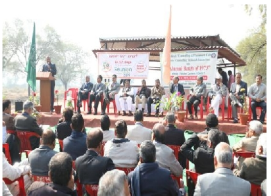
Career Counselling Session on "Alumni Batch of 1973" on Feb. 4, 2019