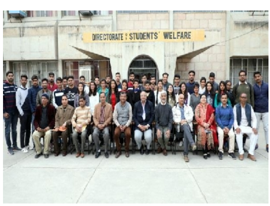
Training on "Agriprenurship" from Feb. 11-27, 2019