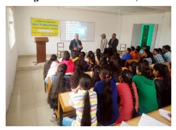
Training on "Personality Development" for the students of COA, Bawal from Feb. 12-26, 2019