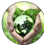
Natural Resource Management