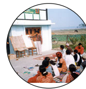
Agri Extension Education