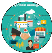
Supply Chain Management