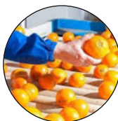
Harvesting and Post-Harvest Processing