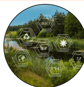
Internet of Things (IoT), Artificial Intelligence in Agriculture