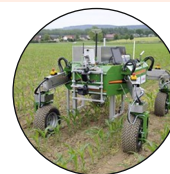
Farm Mechanisation and Agri Engineering