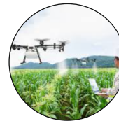
Agri-Input tools and technologies